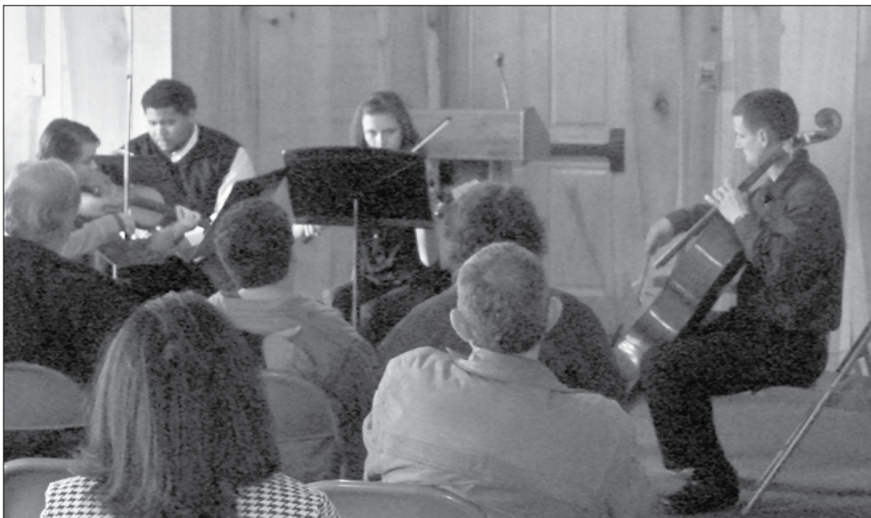
Of the Confederate favorite 'Dixie,' Lincoln thought it "one of the best tunes I ever heard."