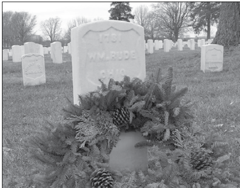
Wreaths Across America at the Camp Nelson National Cemetery